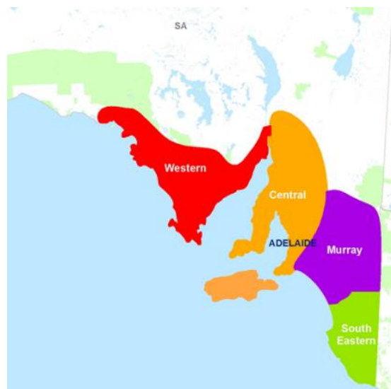
Figure 1: The four studies areas which will form the focus of the Strategic Plans.

As boat ownership and participation in boating continues growing over the next five years, the DPTI will continue its commitment to ensuring that the needs of boat users are being met.